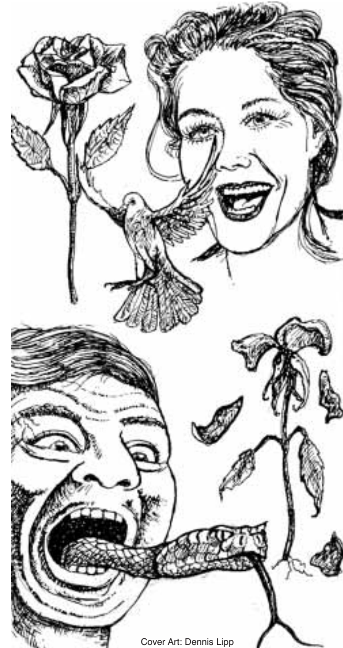
Cover Art: Dennis Lipp